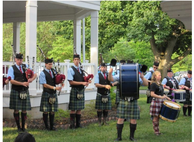
Caledonia Band well received

Keep the date of Thursday, August 16 th to come hear the Caledonia Drum & Bag Pies Band on the museum's front yard. The event is from 5:00 to 8:30 pm with light supper food and drinks.