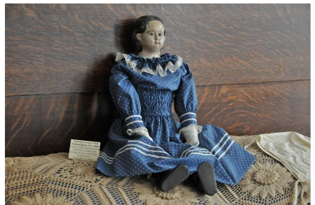
One of many antique dolls in our collection. Come in and see if you can find her!