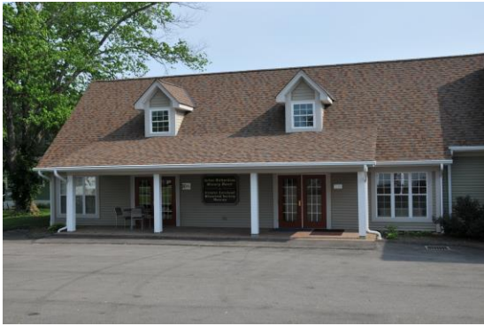
The JoAnn Richardson History House available for rent Call 513-683-5692 for details