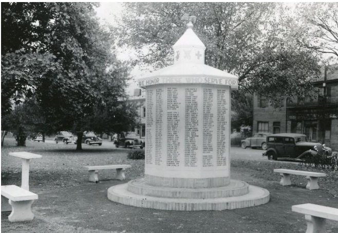
“Honoring Those Who Serve,,,”