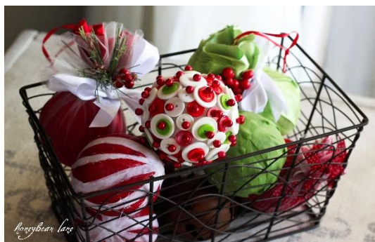
Holiday Arts & Craft Fair – November 3 rd

We will need volunteers willing to man the booth for a couple of hours (two-hour shifts). Please call the office if you are interested in helping.