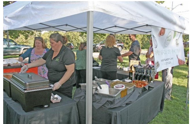
Tano's serving a “Walking Salad” on museum grounds following the tour