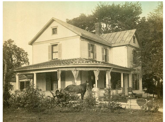
This elegant house, ca. 1865, sat on adjacent property to the Oskamp Estate. It belonged to the Shawhan family.