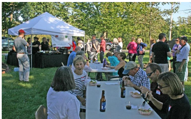
Many guests enjoyed Tano's Food Truck (tent) on Bonaventure grounds following the tour. An opportunity to talk more with owners and Museum members.

Thanks also to the sponsors – Paxton's Grill, Craftsmen Home Improvements, Inc., Bond Furniture + Mattress, under new management, The Schnicke Company, Great Clips, and Accounting Plus LLC.