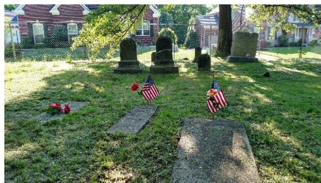
Some restoration has been done

Please consider a charitable gift to show your support of this historical preservation project by sending your tax-deductible contribution to: Ramsey-Paxton Cemetery Association Inc., C/O Rob Geiger, PO Box 25, Loveland, OH 45140. Questions: geigercounter@hotmail.com