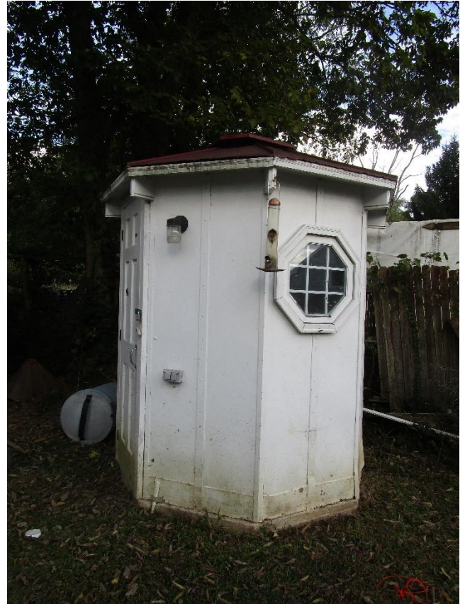
How the kiosk looks today