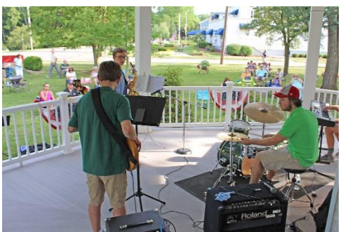
Band members warm up