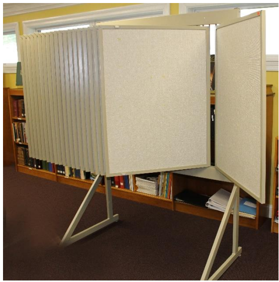
Two display boards are available, like new. Perfect for museums or offices; both take down for easy removal.

Items from the museum collection include antique tools, an intercom system, a 1930's high chair, a 1900's wall clock, picture frames, old books scrapbooks, and much more.