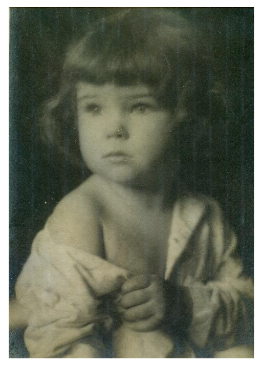
Portrait of unknown child Ca 1920 Tissue Print