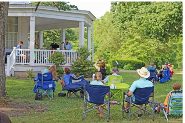
Another picture from July 15th Jazz Fest

Register: Imrchamberalliance.com Cost $10