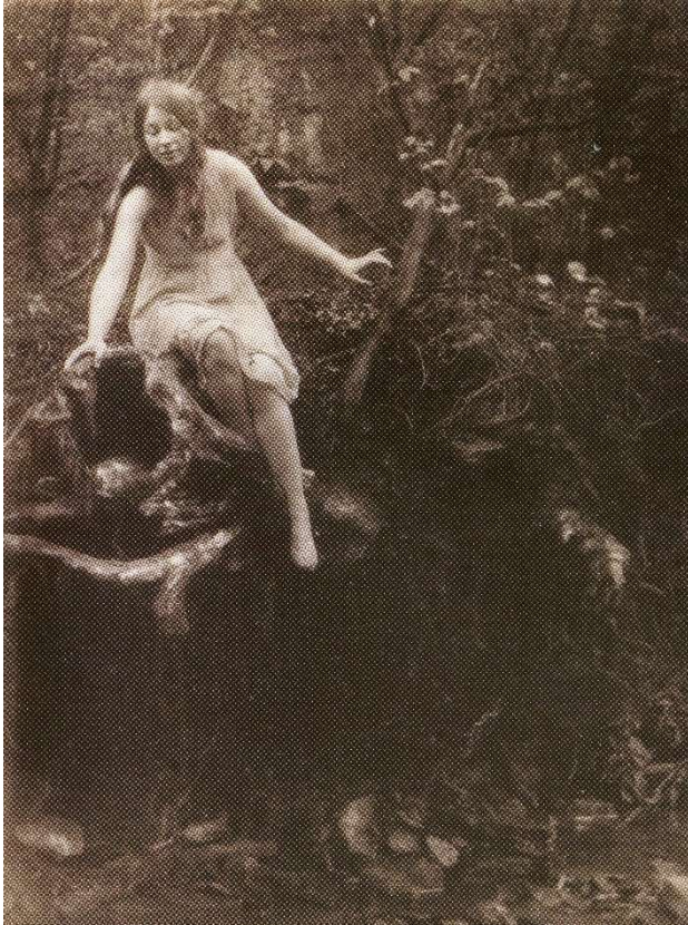
"The Abode of the Gnomes", ca 1921