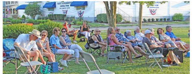
The weather was perfect for this outdoor event