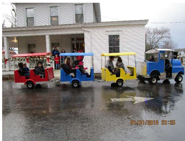
The mini train is always a hit (taken 2016)

LMC will host the mini train, going around the building and the program committee will be discussing possible musical entertainment. Light refreshments will be served in the dining room. We are looking for volunteers to provide home-made Christmas cookies to go with the punch. And the gift shop has some new handmade Santa figures and ballet slippers for sale along with the locally made Loveland pottery, and other Loveland memorabilia.