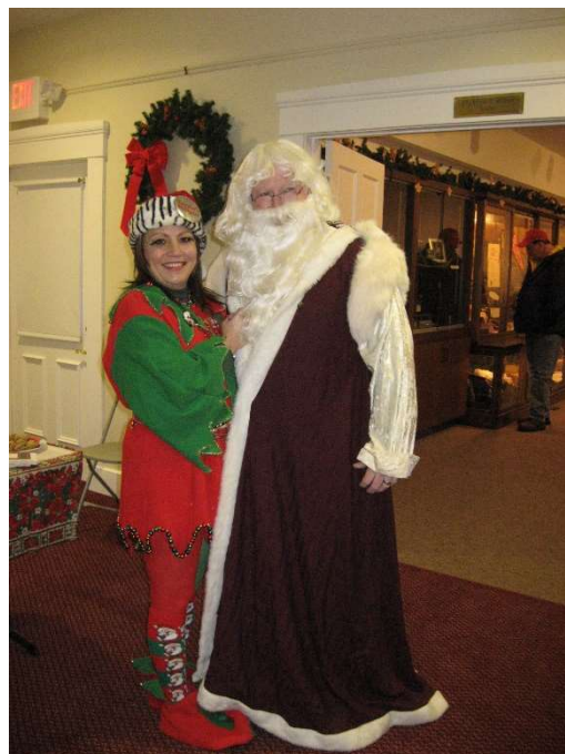
Elf and Father Christmas, ca 2008

The log cabin will be open, heated with a fire in the fireplace and decorated with live greens, cones, etc.