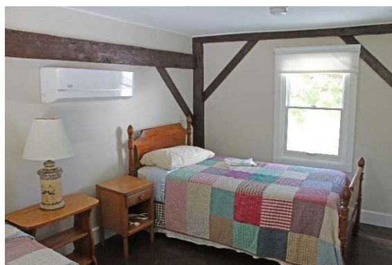
A peek into one of the small bedrooms

This walnut cabinet is full of unusual memorabilia from the Butterworth estate. Note the refinished walnut floors.