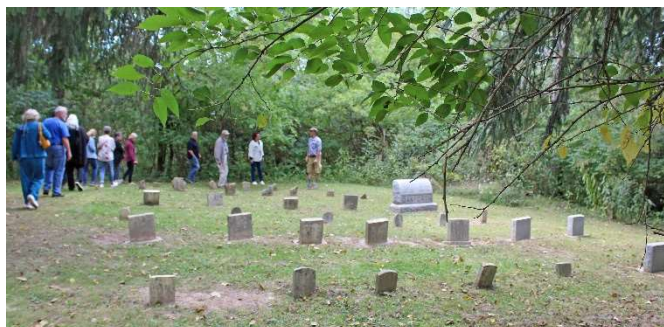
An overview of the Family Cemetery