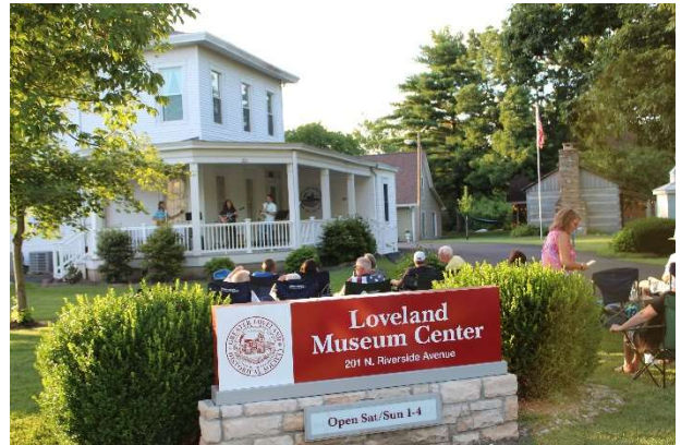
The bushes around the sign were removed in early October – getting ready for a change