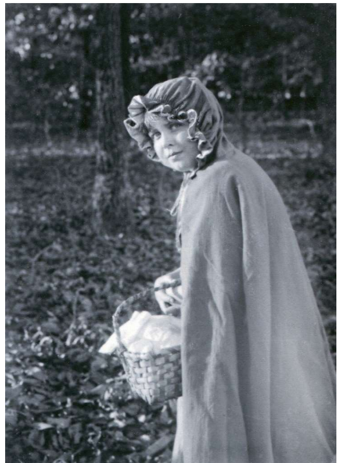
"Red Riding Hood"

LMC will be selling the book, Craft and Camera, The Art of Nancy Ford Cones , for $25.00 (tax included).