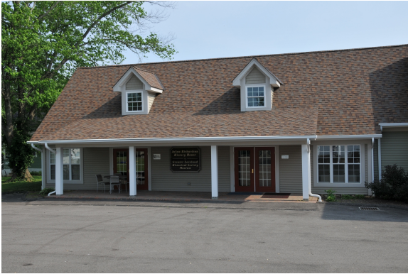
The JoAnn Richardson History House available for rent Call 513-683-5692 for details