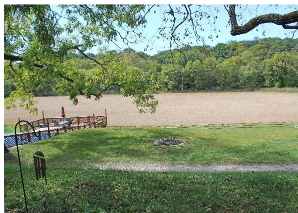
Overlooking the bike trail & river