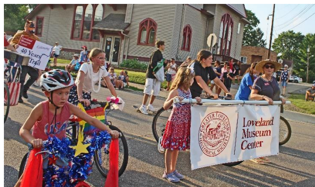
Participants on W. Loveland Ave approaching the bridge.