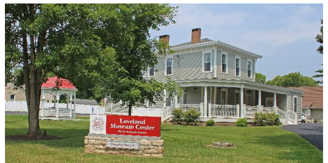
View from the corner of Riverside and Park