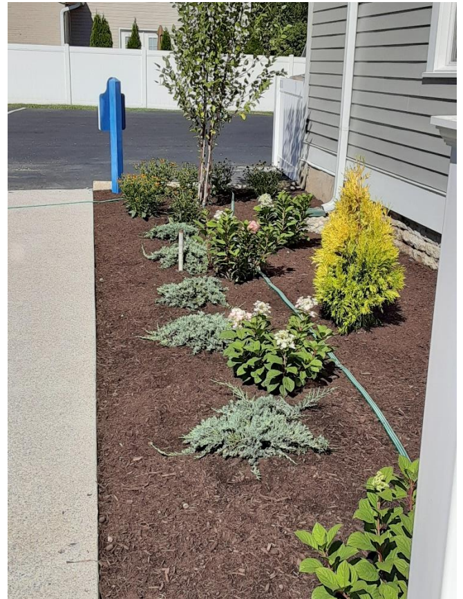
Landscaping along the walk into Bonaventure completed.