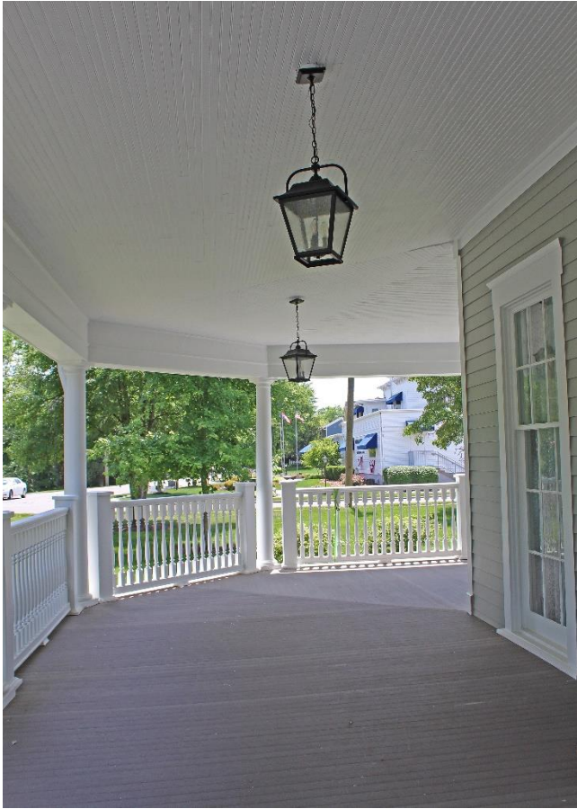
Note the historically accurate light fixtures.