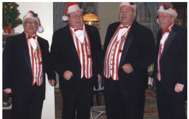
Entertainment in 2009

As in the past we will be recruiting volunteer donations of cookies and treats.