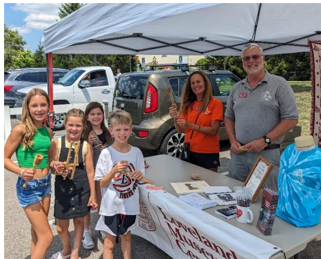
Young people have fun with antique toys at the Farmer's Market