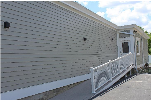
The handicap ramp replaced with new rails, flooring, lights, and a new door opening into the museum.