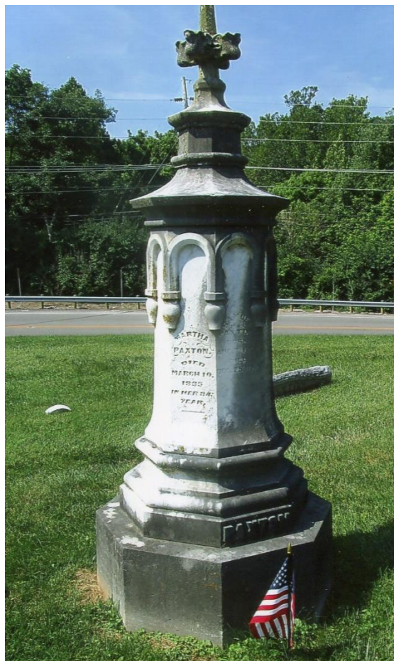
Here is an example of an early ornate marker.