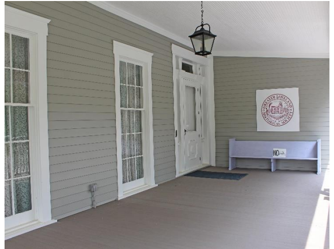
The LMC Logo is replaced with a new sign.