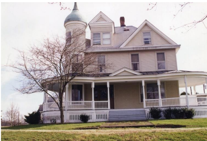
House of Joy was given the Loveland Historical Society Historic House award in 1989.

The Grail will again "gift back to the community" 25% of the appraised value of the land (through price reduction), which means the decision to sell for conservation drastically reduces income received. However, the Grail believes this is a much-needed investment for the protection of the natural habits.