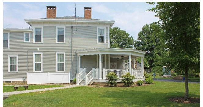
View of entrance to the museum, hiding the AC units, and the newly installed concrete walk