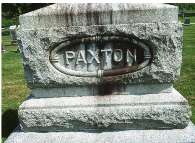
One of many Paxton/Ramsey plots