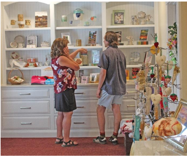
Visitors in the gift shop and gallery below.