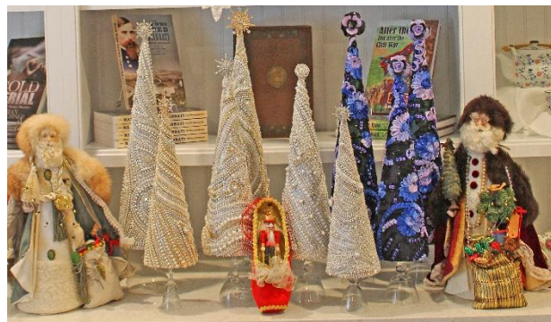
Handmade Beaded trees and Old World Santas

Experience our updated gift shop which will highlight creations by the LMC Design Group as well as stunning antique glass ware, porcelain, and vintage jewelry. Your holidays will sparkle with be-jeweled tabletop Christmas trees, decorated salt cellars, Old World Santas, and decorated ballet slippers. Loveland themed Christmas ornaments as well as new hand-crafted ornaments can adorn your tree. Treat your loved ones to one of the many handmade creations such as stunning fiber pieces, turned wood creations, soft sculptures, pottery, and framed artwork created by local artists.