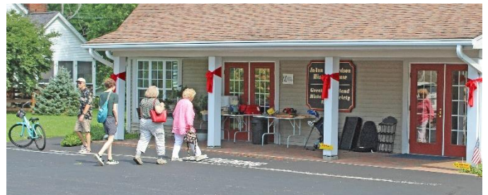
LMC raises over $1200