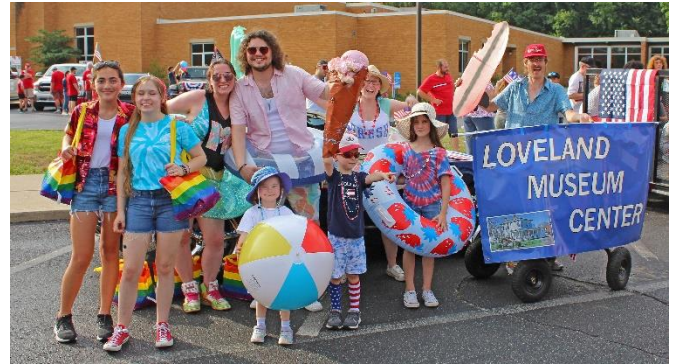
Volunteers line up !