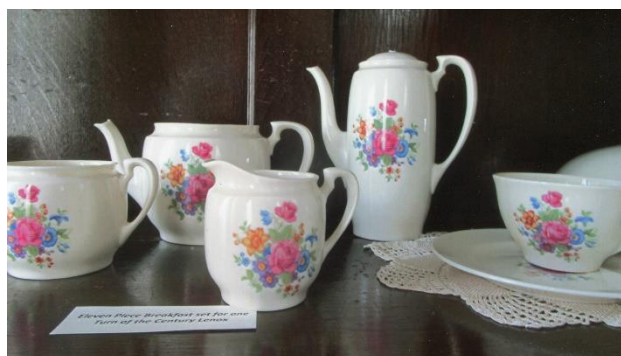
Lenox Breakfast Set

Linda Wasson 223-9333 10653 Roachester Cozaddale Rd. Goshen, OH 451