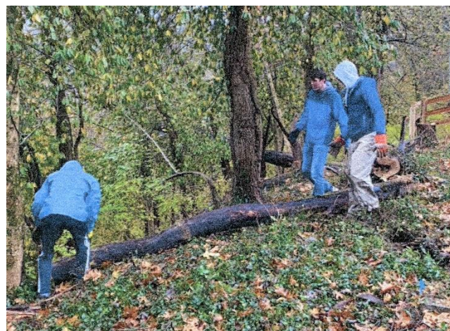
Scouts at work, provided by the scout troop