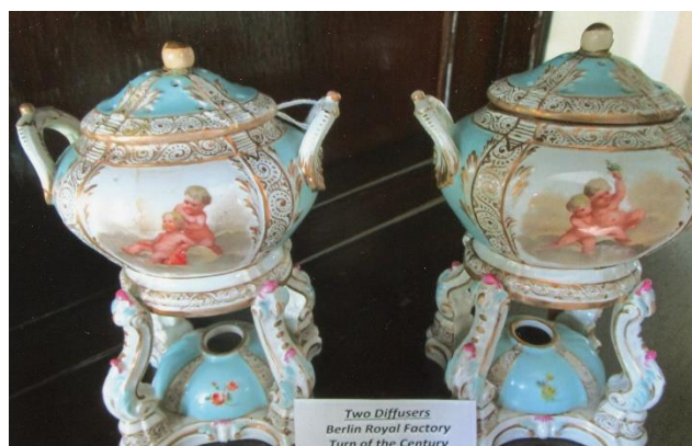
Turn of the Century Berlin Royal/KPM Diffusers