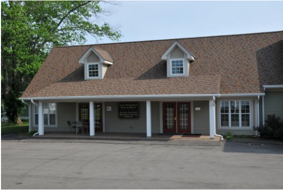
The JoAnn Richardson History House available for rent Call 513-683-5692 for details