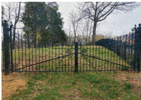
New fence installed by Eads Fence Co. Ramsey Court, White Pillars Subdivision