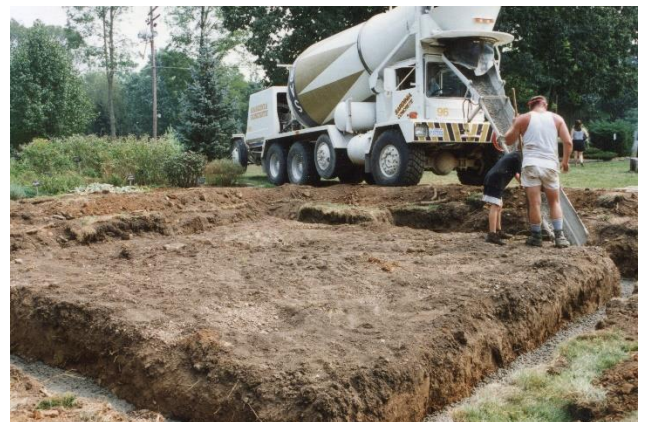
After many months of planning and fund raising, reconstruction of the Rich Log Cabin begins in 1995.