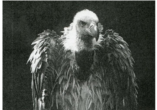
“Scorn” taken from page 196