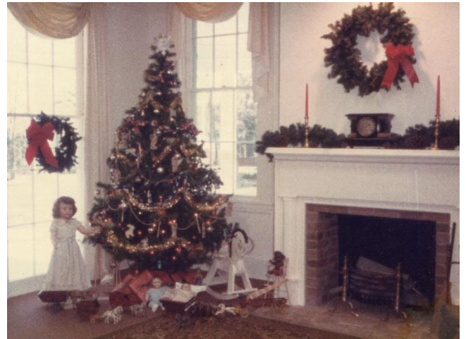
1984 Christmas in the front parlor. Many chances have been made since this picture was taken.