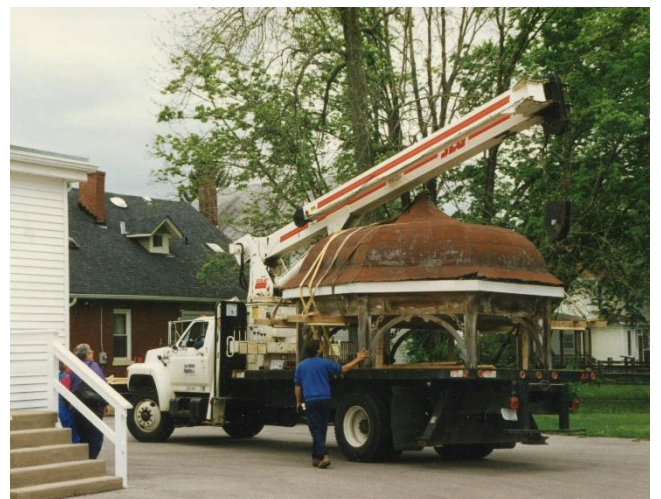
Expansion of the museum campus continues in 1997 with the delivery of the Bishop Coleman Gazebo. It was originally at the corner of Riverside & W. Loveland Avenue and had been stored on Adams Road. A formal dedication was held in the fall.

The library has lots of scrapbooks showing the growth of the Loveland Museum Center. Make an appointment and come look back at our past years.