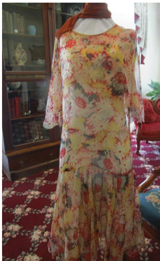
One of several "Roaring Twenties" dresses from the LMC collection