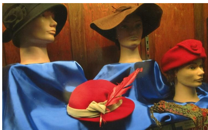
A sample of "Roaring Twenties" Hats