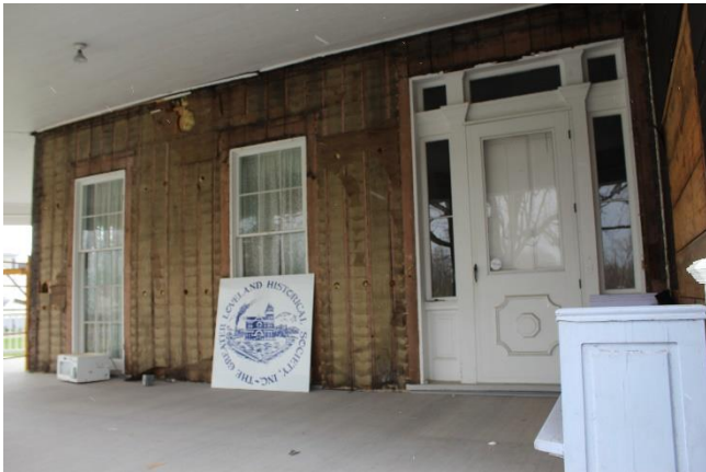
More vertical siding on the porch

As with any renovation of an historic house, surprises were found. It was determined that the lower roof was falling and needed to be completely replaced. The good news is the 161-year-old structure still has good bones and no major structural problems were uncovered.