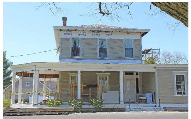
Note the removal of the railings and new rounded columns

New porch flooring and new railings will be installed.