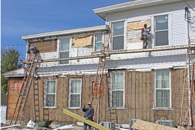
Removing old siding – note original vertical siding, also known as board & batten siding

Many of you may have noticed some changes taking place on the grounds of the museum center. Our main building and museum, Bonaventure, is getting a much-needed exterior makeover. The result will include all new siding and trim, the return of corbels on the upper structure, a porch refresh, and new sidewalks. The previous aluminum and vinyl siding was likely 50 years old (or perhaps even older) and was deteriorating rapidly. Our aim is to restore Bonaventure to resemble how it looked when built by Dr. Law in 1862.