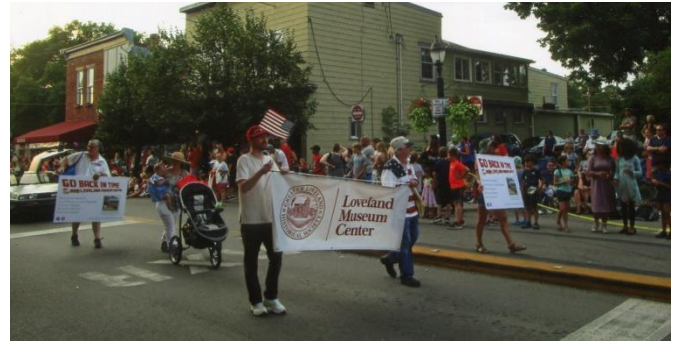
LMC on July 4, 2021