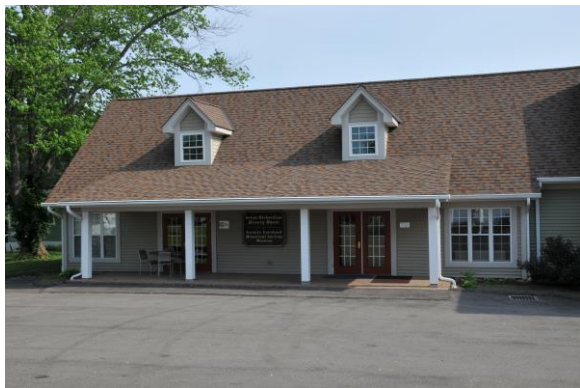
The JoAnn Richardson History House available for rent Call 513-683-5692 for details.