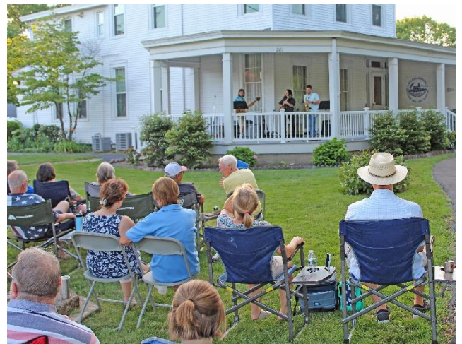
Concert in 2022

Bring a picnic, your own beverage, lawn chair, and friends to enjoy this entertaining band. The band members are formerly from Loveland and have entertained LMC in the past.