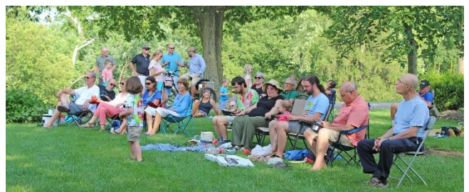
Concert in 2021