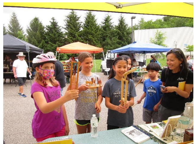
Unknown children stop at the LMC booth last year.