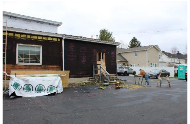
Steps and the door in back are removed.

thank you for your continued support. If you have not yet donated, please know that your gift will help ensure that our museum can continue to preserve the wonderful history of Loveland,