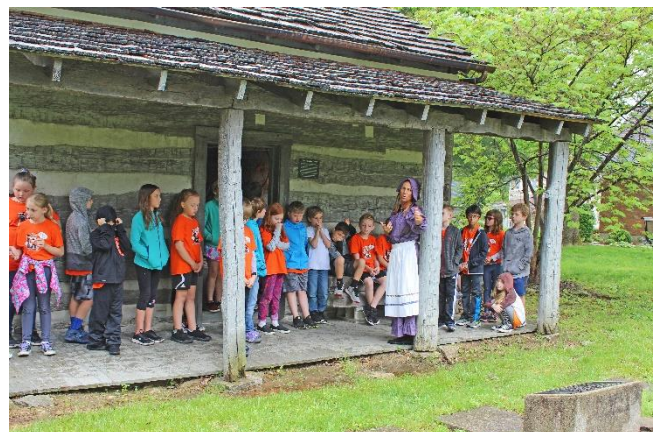
One of the classes pose for a picture

Having two people doing the school tours allowed for a larger group at a time, which shortened the number of days needed for tours.