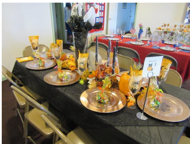
Volunteers create each table with their own theme & design, using special plates and other decorations.

Reservations are required (if you want to fill a table of six to eight, please indicate on your reservation) by July 31. Cost is $20 per person; raffle tickets at the door are $1.00 each or 6 for $5.00. Either register on-line with PayPal or send to 201 Riverside Ave.; Loveland, Oh 45140.