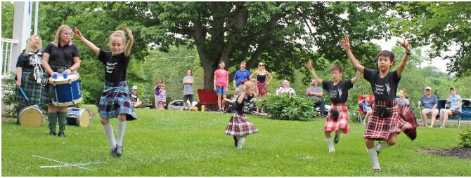
About 65 people enjoyed dancers, bag pipes, drums, food and drink on museum grounds June 6 th .