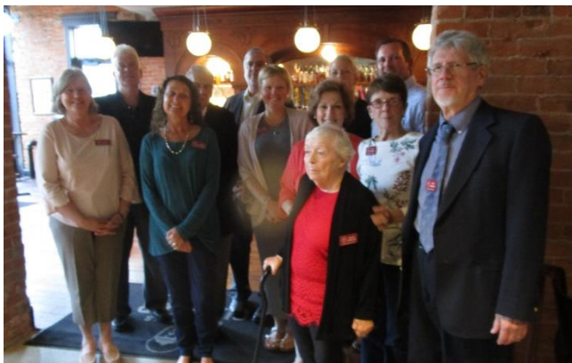
2019-2012 Board of Trustees