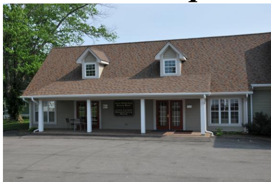
The JoAnn Richardson History House available for rent Call 513-683-5692 for details