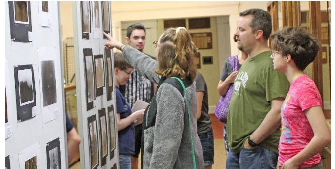
Students point out their photos at the well-attended reception held May 9 th inside the museum.