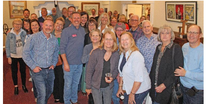
April 10, Wine Tasting with 59 attendees