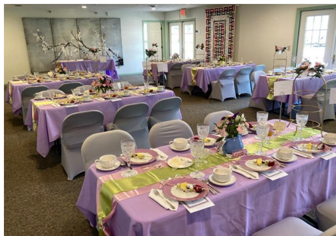
Mother's Day Tea with 38 in attendance