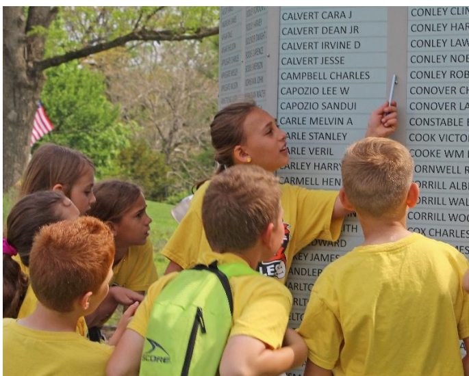
3 rd graders making observations of the World War II Honor Roll