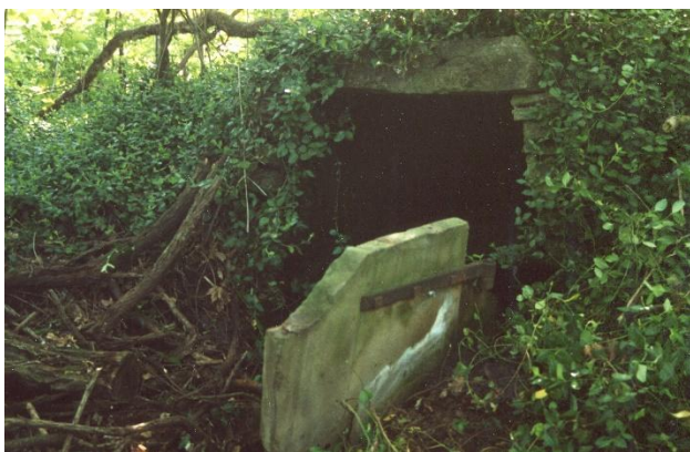
Crypt picture at Hill Cemetery taken 2004