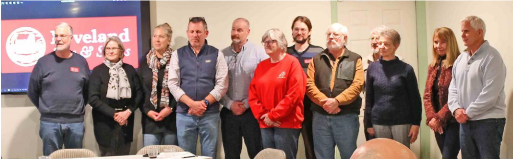
Installation of 2025-2027 LMC Board

From wine tastings to Lunch and Learns to hosting field trips for Loveland Elementary School third graders, this spring has been busy!