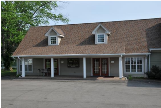
The JoAnn Richardson History House available for rent Call 513-683-5692 for details