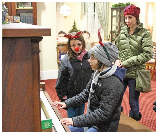
Pumping the piano is always a hit!