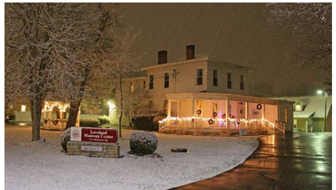
Pete Bissman captures this lovely snow picture of the Museum decorated for Christmas in late November