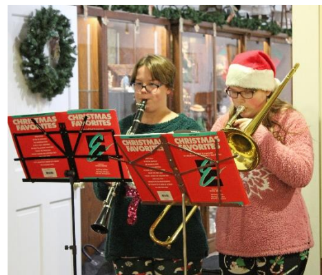
Middle School students entertain