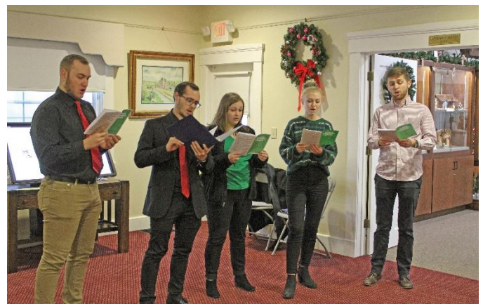
A quintet from the Loveland Presbyterian Church entertained our guest with beautiful Christmas Music