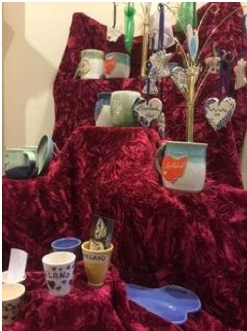
Samples of "Loveland Pottery"