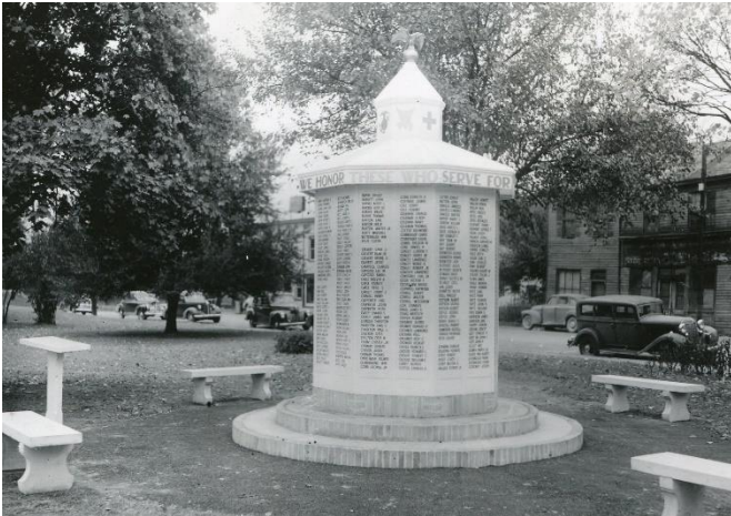
"Honoring Those Who Serve" 1944-1953

In the coming weeks, the Loveland Museum Center will begin restoration of the original World War II Honor Roll Monument which once stood in downtown Loveland. Its purpose was to honor Loveland area citizens who were actively serving their country during World War II.