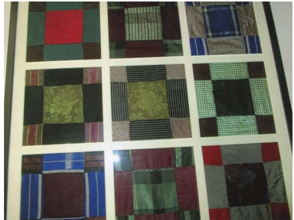
Framed turn of the century quilt squares, too fragile to use for a full sized quilt.

The old school desks are from Loveland Schools. Other display items included school memorabilia, such as year books, pictures of old school buildings and information about the school system over the years.