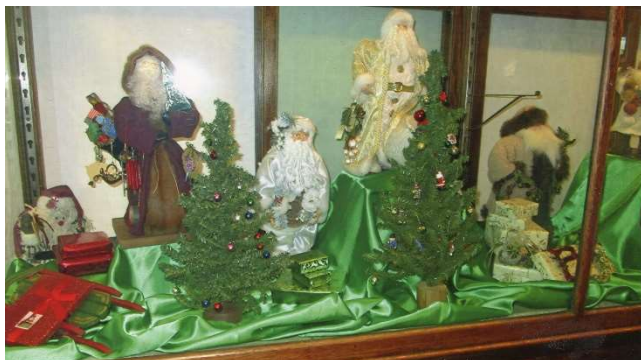
Part of the Santa Display in the Gallery