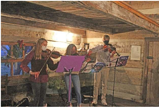
Students from the Loveland Music Academy entertain in the Rich Log Cabin – in front of a roaring fire.