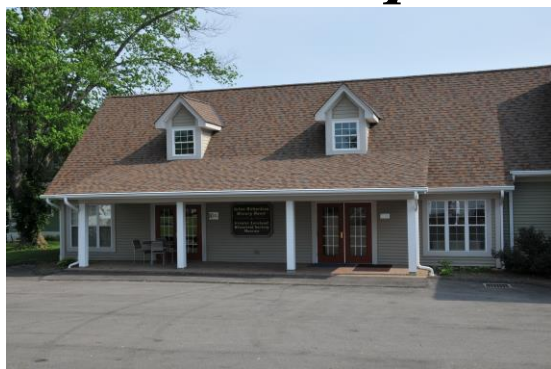
The JoAnn Richardson History House available for rent Call 513-683-5692 for details