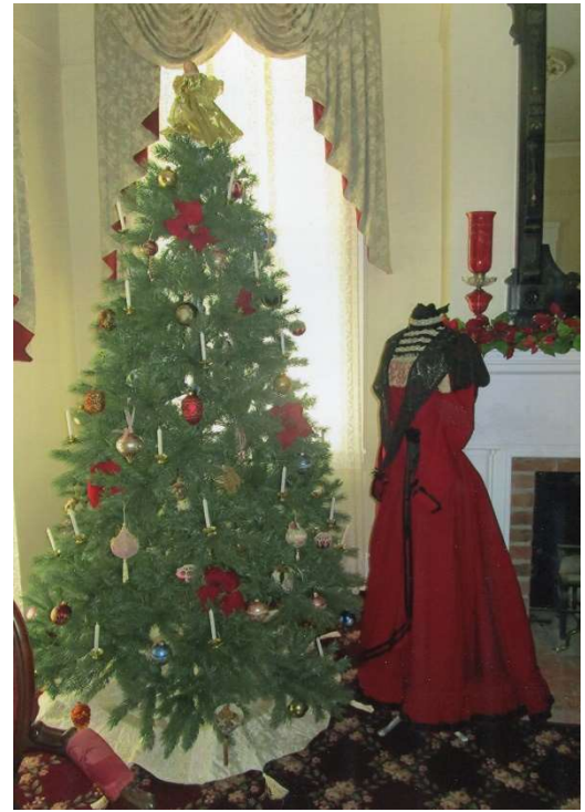
Front Parlor Christmas Tree