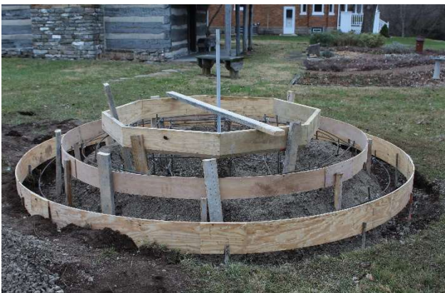
Framing is complete by Tuesday afternoon

Cement was poured on January 7 th , so the kiosk can be moved to the base and restoration of the shell can begin.