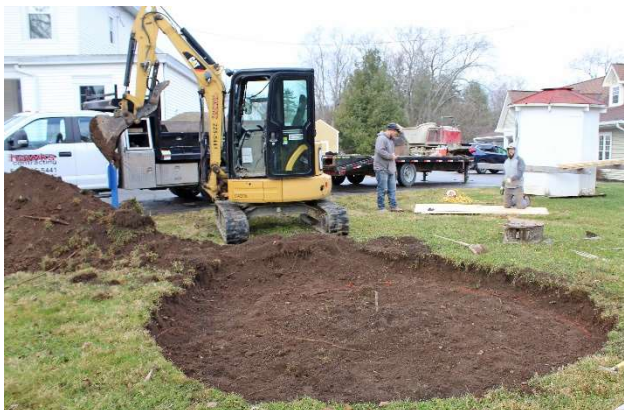
First workers dig the hole

By Monday, January 4 th , the trucks arrived and work on installing electrical connections and the framing for the cement began.