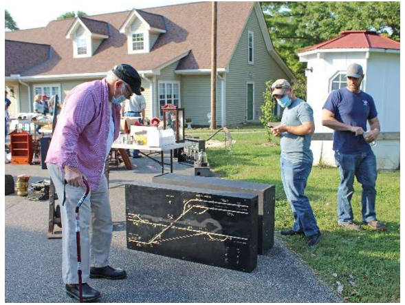
The big ticket item went for $5,250.00