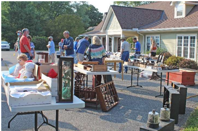
Everything was viewed outside before the bidding

LMC was able to reschedule two of the Lunch and Learn sessions that were postponed due to COVID, although both limited in number of guests permitted and a change to a "Snack" instead of sit-down lunch. Everyone wore masks inside the History House.