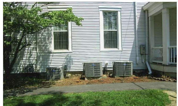
Bonaventure after bushes were removed