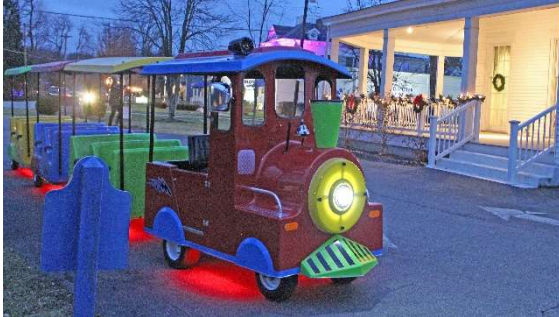
The train was waiting to go, but few children showed up to ride. Big thanks to our sponsors – Accounting Plus, Tufts Schildmeyer Funeral Home, and Great Clips.