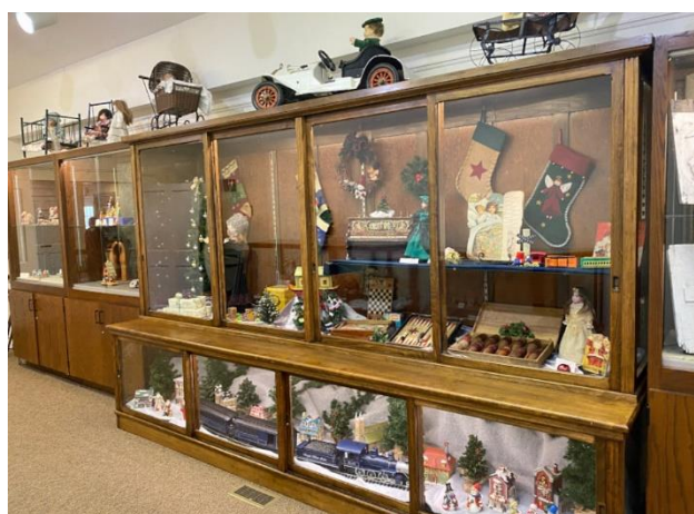
More decorations in the gallery