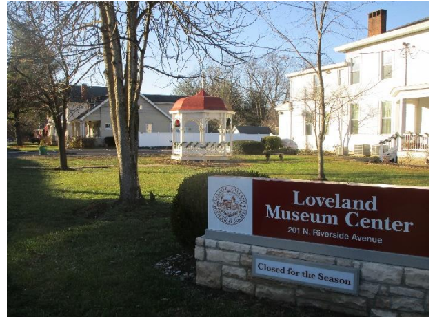
Ready for new landscaping