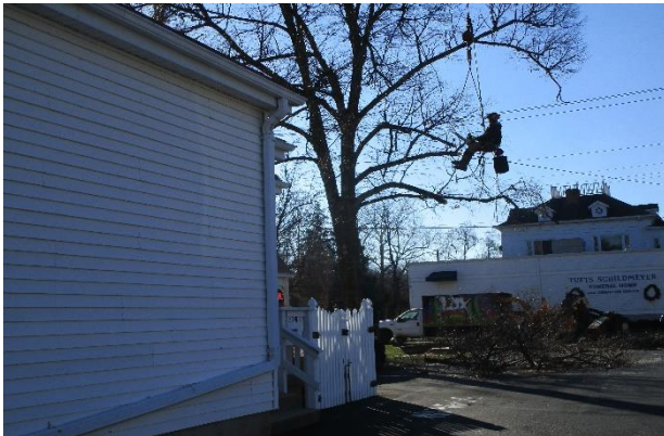
The “tree monkey” swings out over the parking lot