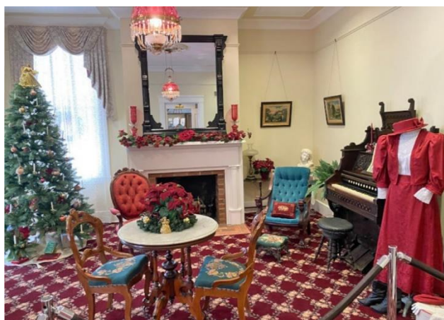
A Victorian Christmas in the front parlor