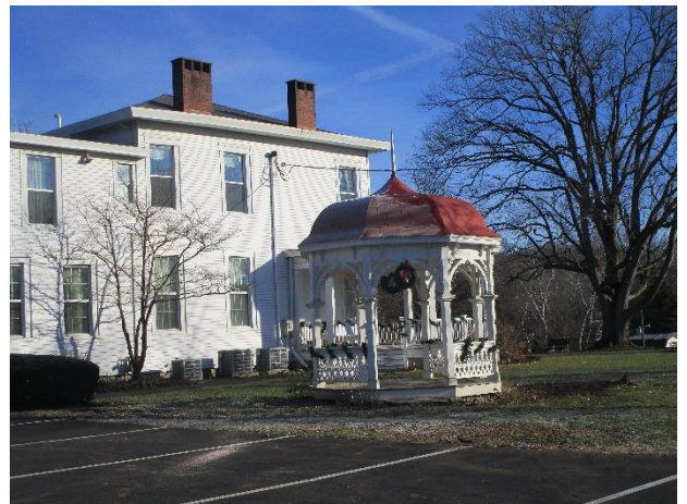
The Gazebo more visible from Park Avenue