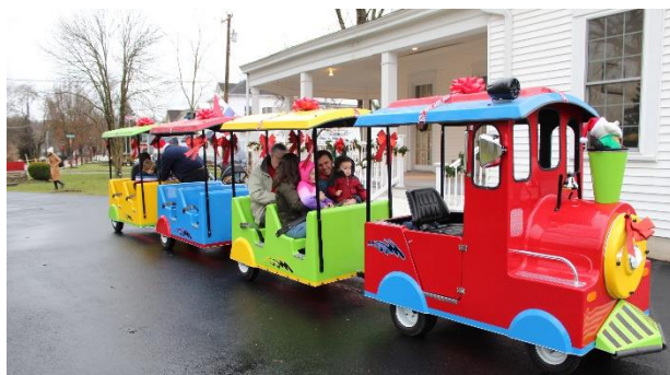
Children's Train ready to roll

LMC had guests and entertainment inside the museum for the December 18 th Christmas event. Thanks to all who provided homemade cookies packed in snack bags – leftovers were sent to a church in Cincinnati which provides food for the homeless.