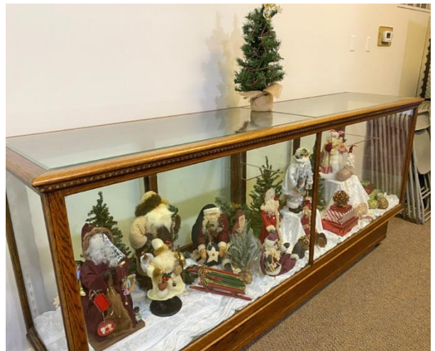
A collection of Santa figures in the Gallery