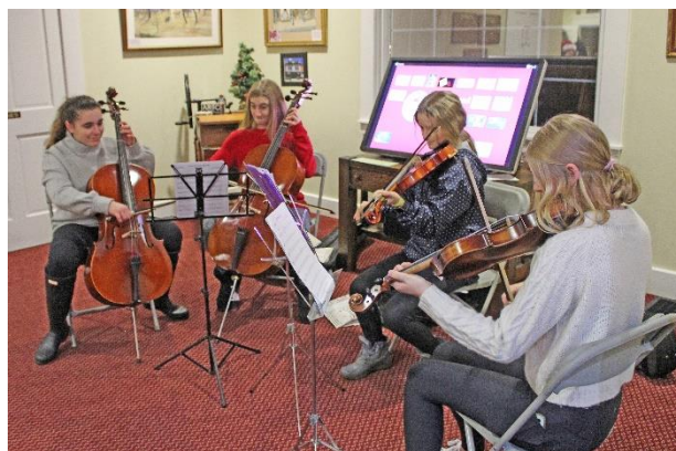
Loveland students from the Music Academy entertain guests during the evening