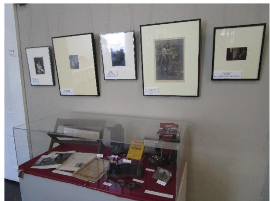
NFC Loan to Heritage Village