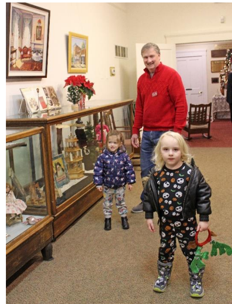
Some of our holiday guests enjoying the displays.