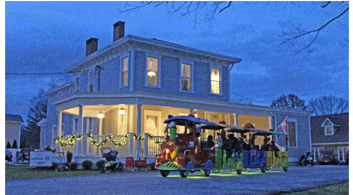
The train provides a fun trip for the kids.

What a fantastic turnout! Over 350 holiday guests toured Bonaventure and the Rich Log Cabin on December 14 th . Thanks to everyone who brought home-made cookies – they were definitely a crowd-pleaser! What a fun event!