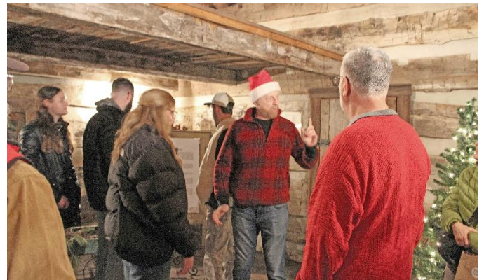
The Rich Log Cabin was warm and cozy for visitors.